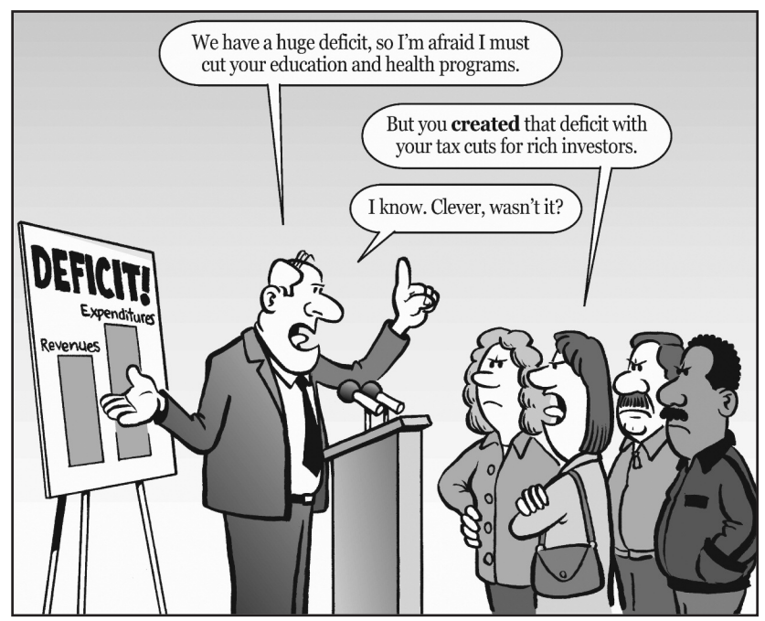
Illustration: Tony Biddle